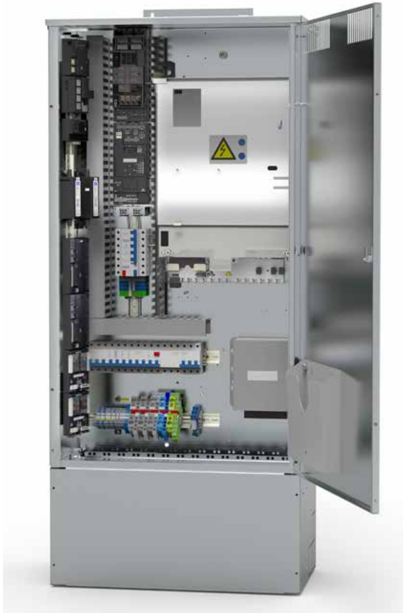
The KONE ReGenerate™ 200 controller cabinet